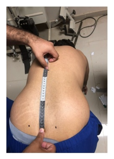
Figure 2. Lumbur Flexion Assessment