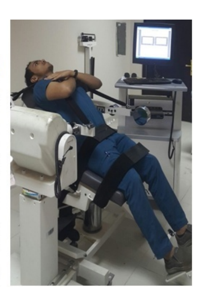
Figure 4. The Biodex System 4